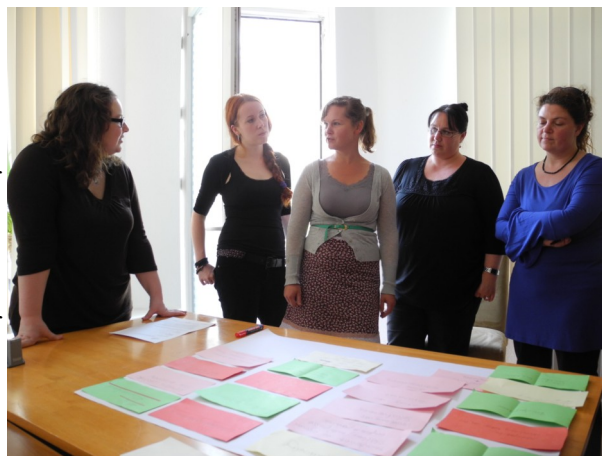
The meeting of the training group from Lipsk, Germany.

This first part of the course was mostly devoted to team-building, empowering self esteem and overcoming life obstacles connected with single parenthood. Although in the group there is only one man, and the age-range is from 21 to 45 years, all participants found many similarities according to their life situations. They enjoyed conversations and different group activities. All participants eagerly are waiting for the next part of the course dedicated to film workshops. This will start on 24 th of October, 2011 with the most creative part - scriptwriting.